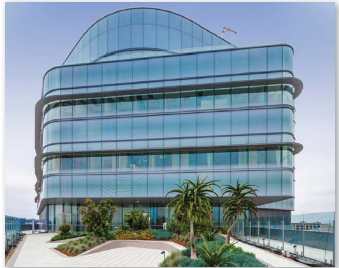
Jacobs Tower Medical Center

San Marcos, California Rudolph and Sletten