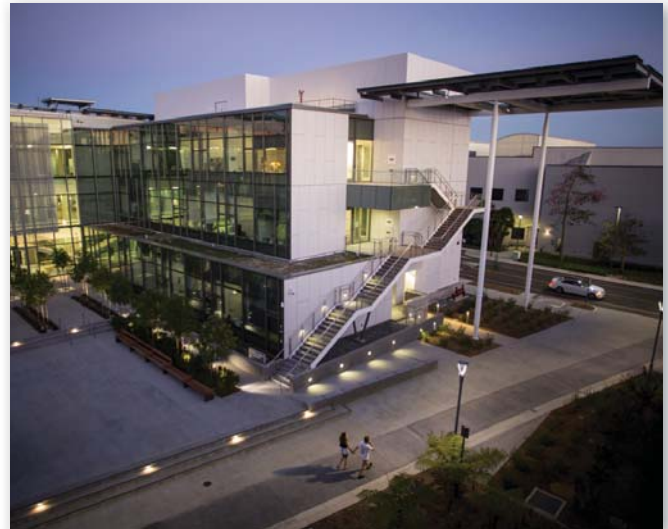
LMU Life Science

San Francisco, California Rudolph and Sletten