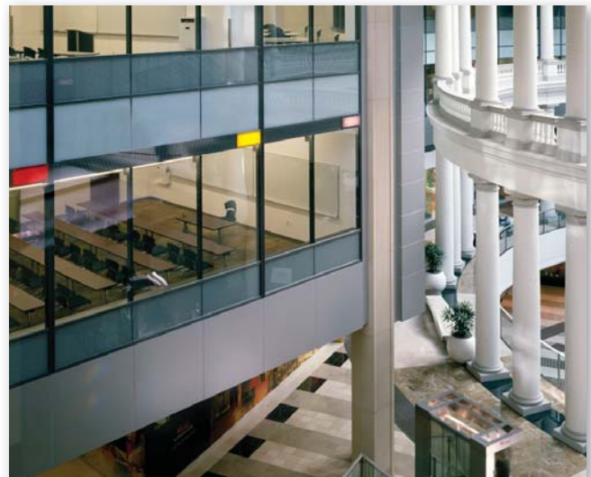
San Francisco State Downtown Campus at Westfield