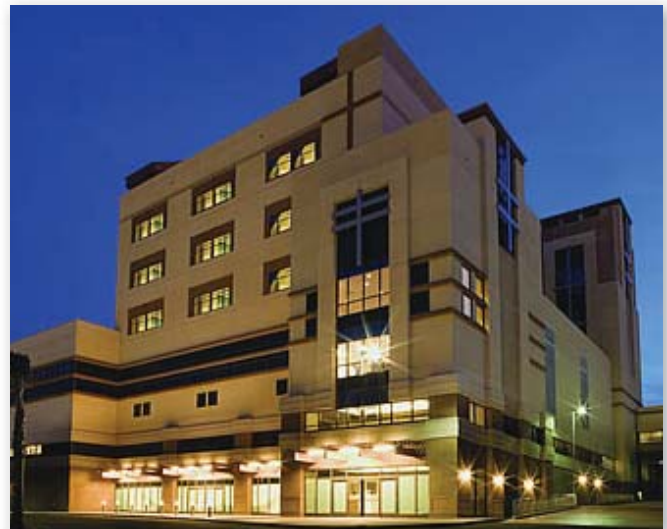
White Memorial Hospital