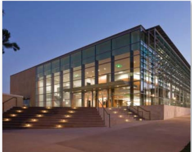
SOKA University Performing Arts