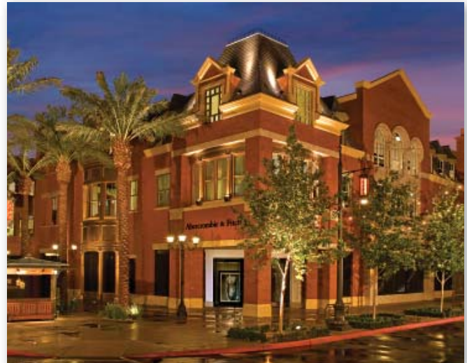
Abercrombie & Fitch at Town Square

Beverly Hills, California Illig Construction