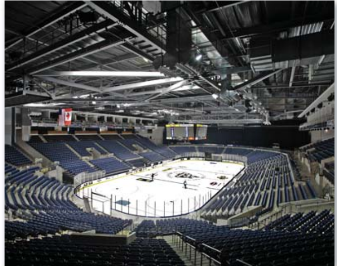
Stockton Events Center

Garden Grove, California Matt Construction