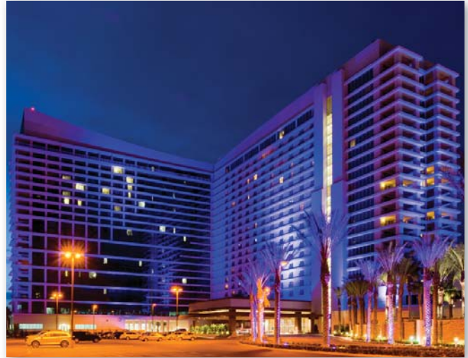
Harrah's Resort & Casino

Las Vegas, Nevada Perini Building Company