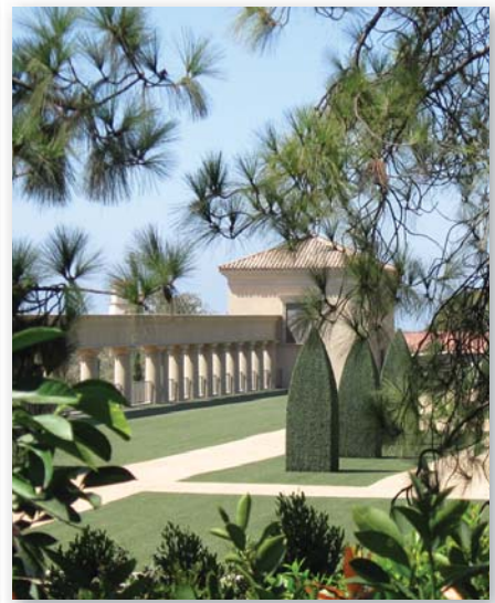
Top of Pelican Hill Parking Structure