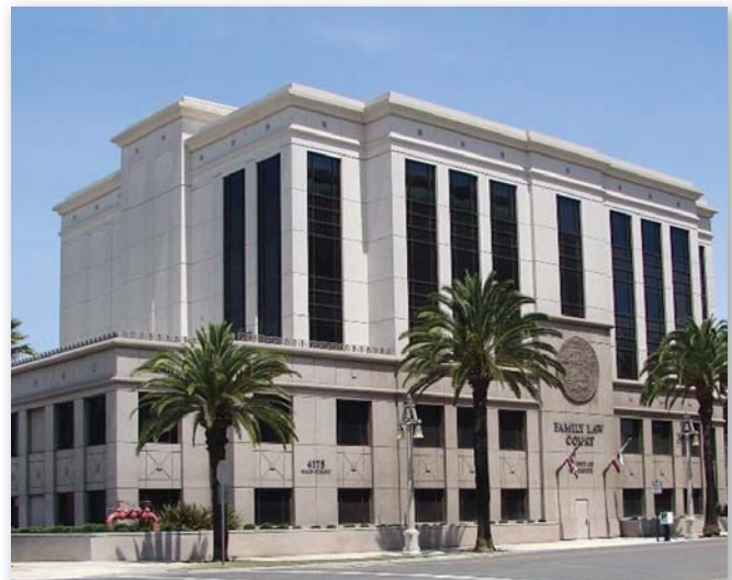
Riverside County Family Law Court