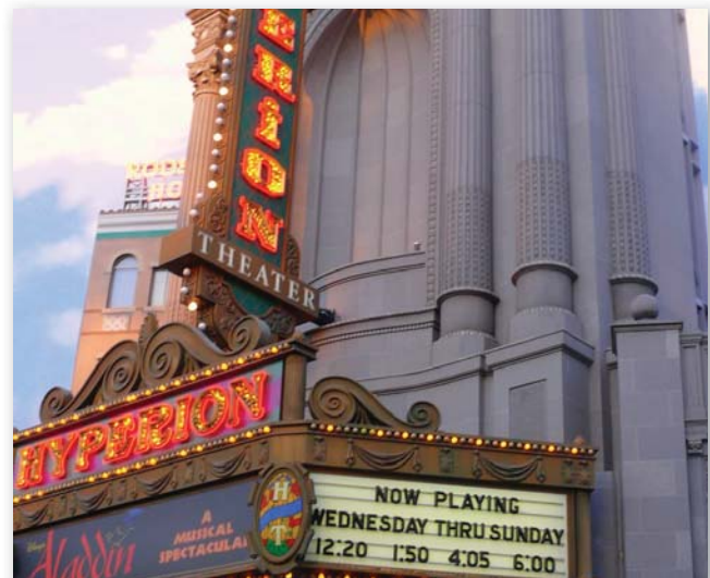
California Adventure Hyperion Theatre