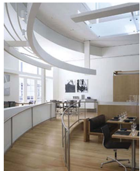
CUT, a Wolfgang Puck Restaurant