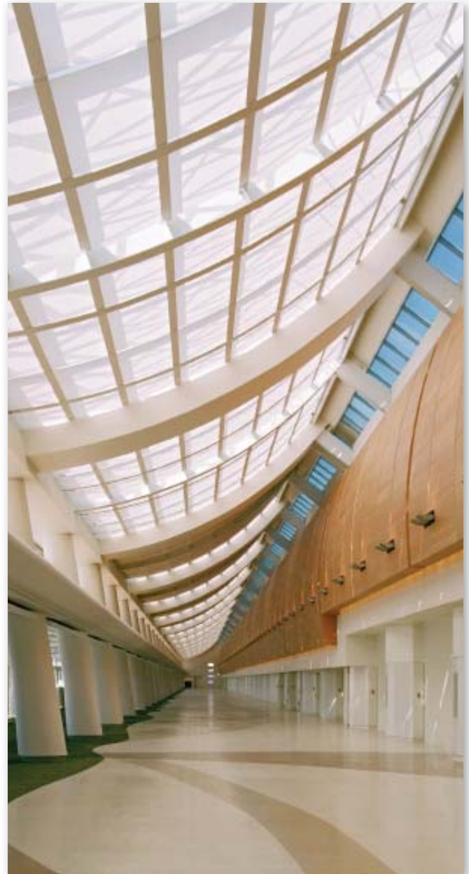
Mineta San José International Airport

Van Nuys, California Tutor-Saliba Corporation