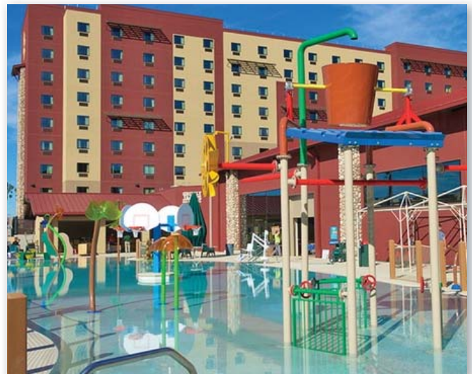
Great Wolf Lodge