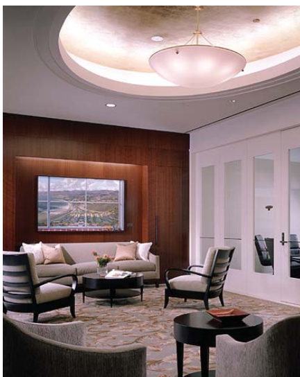
Gibson, Dunn & Crutcher, LLP