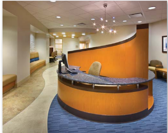
Scripps Cath Lab