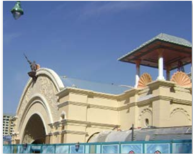
California Adventure Disney's Little Mermaid

California Adventure Carthay Circle Theatre California Adventure Disney's Little Mermaid California Adventure Hyperion Theatre California Adventure Main Entry Buildings California Adventure Hollywood Backlot California Adventure Soaring Over California California Adventure Muppet Vision California Adventure Schmoozie's Facade California Adventure ABC Media Cafe California Adventure Disney Animation California Adventure Disney Legends Disneyland Indiana Jones Expeditions Disneyland Matterhorn Bobsleds (Remodel) Disneyland Aladdin & Jasmine's Adventure Disneyland Dream Suite Disneyland Team Disney Parking Structure (Toontown Backdrop facade) Disney Executive Office Disney Concert Hall, Founder's Room Disney Motion Pictures Set Disney Retail Tenant Improvement Team Disney Animation Facility Disney Newport Mock-Up Disney Goals Skating Downtown Disney Bldg. AA Team Disney Administration Team Disney Cafeteria