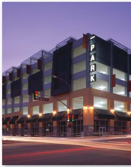
Northpark Parking Structure