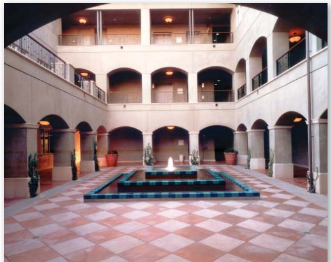
Dreamworks Animation Facility