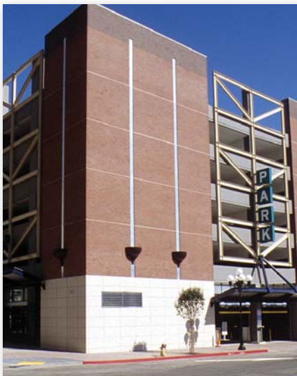
R-7 Parking Garage