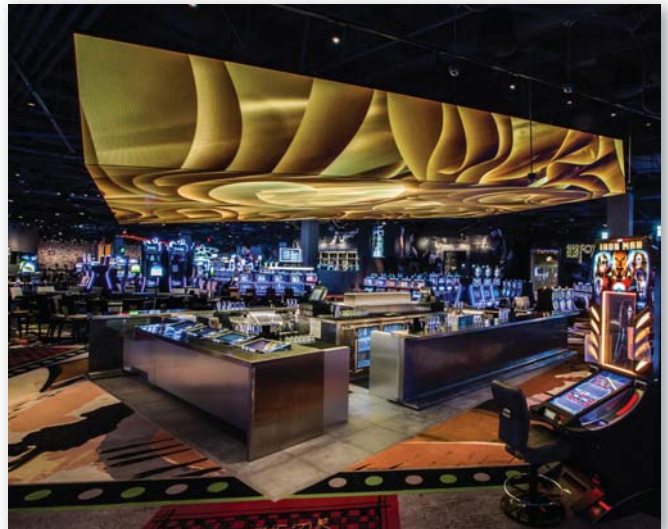
SLS Hotel & Casino