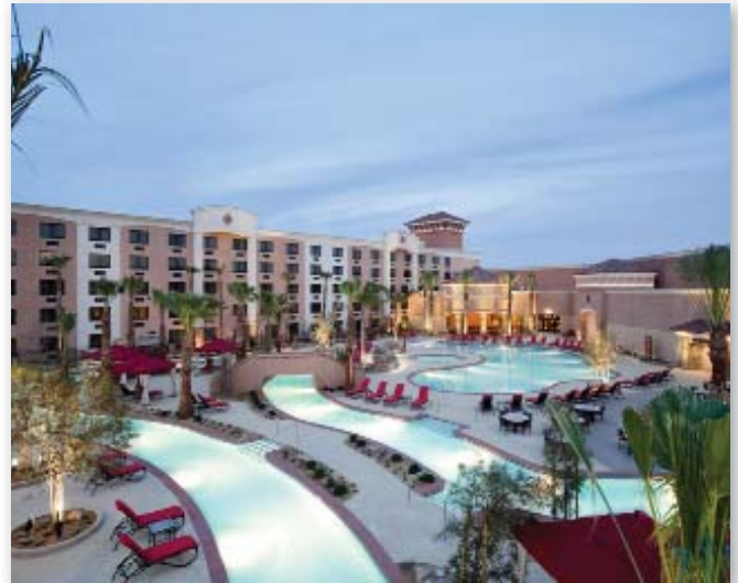
Quechan Casino and Resort

Westlake Village, California Matt Construction