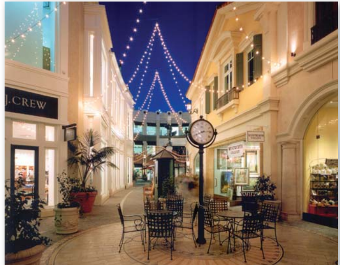
The Grove at Farmer's Market

San Francisco, California Swinerton Builders