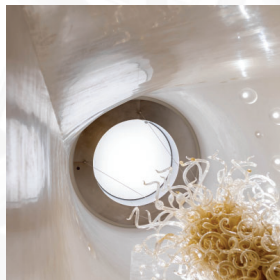
MINGEI MUSEUM WWCCA Project of the Year