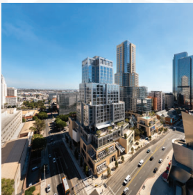
THE GRAND LA AWCI Excellence in Construction Quality, WWCCA Project of the Year

RAYMOND HAS BEEN A LEADER IN LATH AND PLASTER since the 1940s when it completed the plastering contract for the build-out of the city of Lakewood, California. Today, Raymond remains at the forefront in lath and plaster. With Raymond's deep experience and attention to detail, we can solve the most difficult waterproofing issues and plaster the most complex surfaces, ensuring that your plaster will be aesthetically beautiful for years to come.