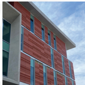
UNLV MEDICAL EDUCATION BUILDING WWCCA Project of the Year