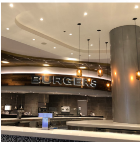
SOFI STADIUM & YOUTUBE THEATER