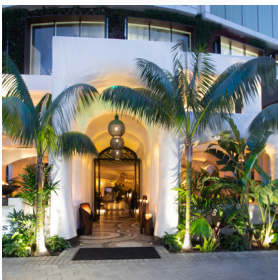
JAVIER'S AWCI Excellence in Construction Quality "Best of the Best"