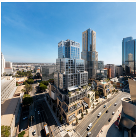
THE GRAND LA AWCI Excellence in Construction Quality, WWCCA Project of the Year

RAYMOND HAS BEEN A LEADER IN LATH AND PLASTER since the 1940s when it completed the plastering contract for the build-out of the city of Lakewood, California. Today, Raymond remains at the forefront in lath and plaster. With Raymond's deep experience and attention to detail, we can solve the most difficult waterproofing issues and plaster the most complex surfaces, ensuring that your plaster will be aesthetically beautiful for years to come.