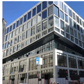
120 STOCKTON WACA Construction Excellence