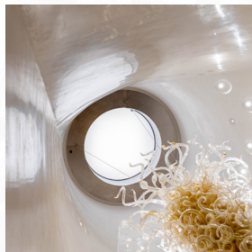
MINGEI MUSEUM WWCCA Project of the Year