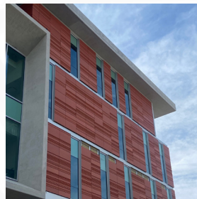
UNLV MEDICAL EDUCATION BUILDING WWCCA Project of the Year